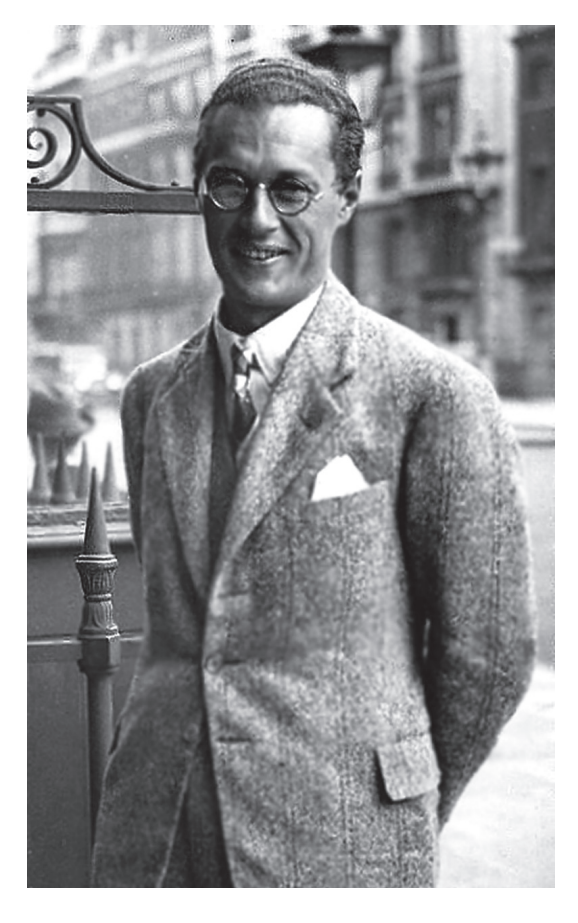
Kazimierz Wierzyński on a London street, 1928. Koncern Ilustrowany Kurier Codzienny – Archiwum Ilustracji, 1-K-1913.