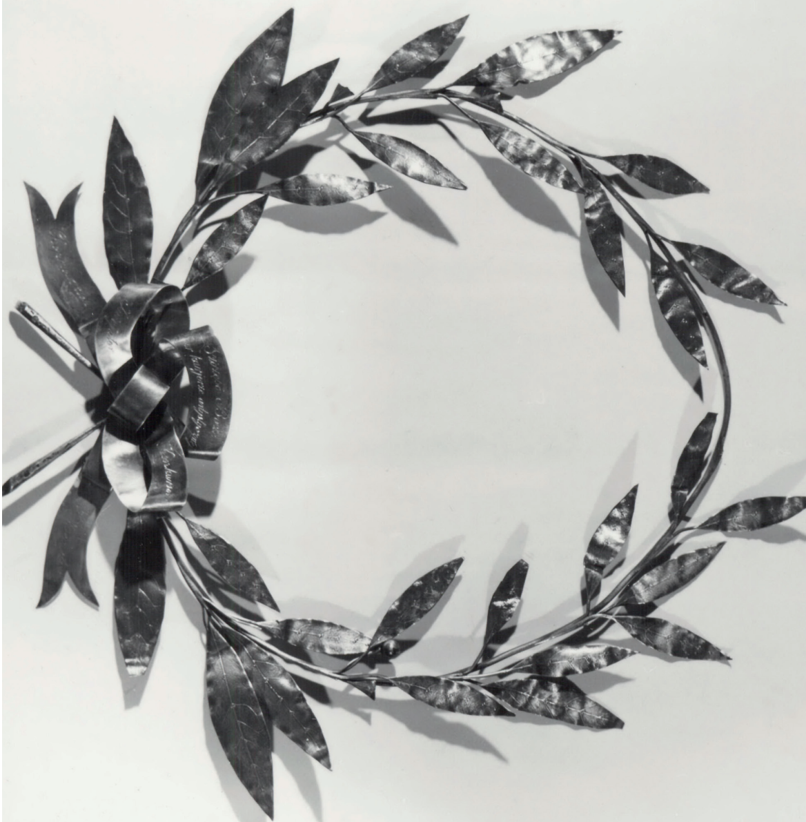
Laurel wreath of Halina Czerny-Stefańska, winner of joint First Prize in the 4th International Fryderyk Chopin Piano Competition (1949).