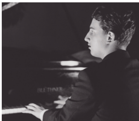
Maurizio Pollini, winner of First Prize in the 6th International Fryderyk Chopin Piano Competition (1960), at the piano.