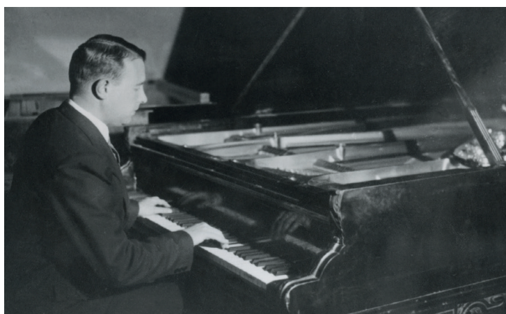
Lev Oborin, winner of First Prize in the 1st International Fryderyk Chopin Piano Competition (1927), in 1953.