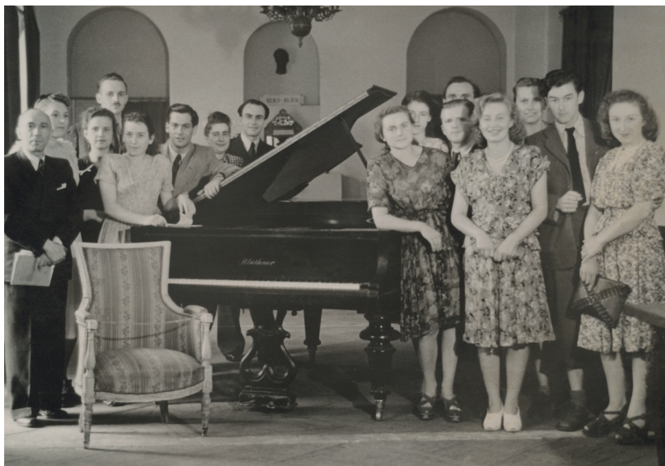
Participants in and guests of the 4th International Fryderyk Chopin Piano Competition around a piano, 1948. Photographer unknown; Biblioteka-Fonoteka-Fototeka NIFC, F. 3313.