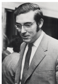
Garrick Ohlsson, winner of First Prize in the 8th International Fryderyk Chopin Piano Competition (1970).